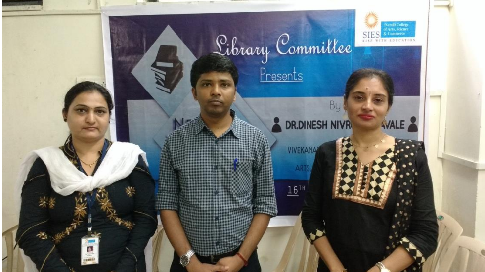
NET / SET training session for MCOM students