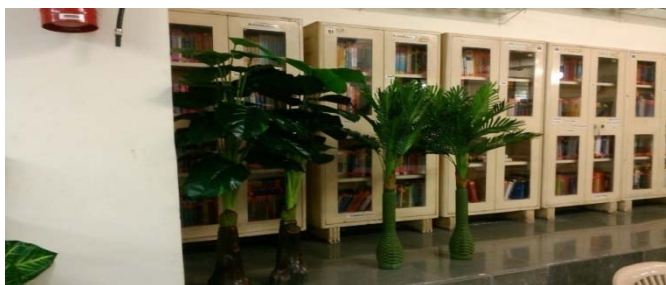
Plants enhancing the ambience

2 Enhanced ambience using artificial plants