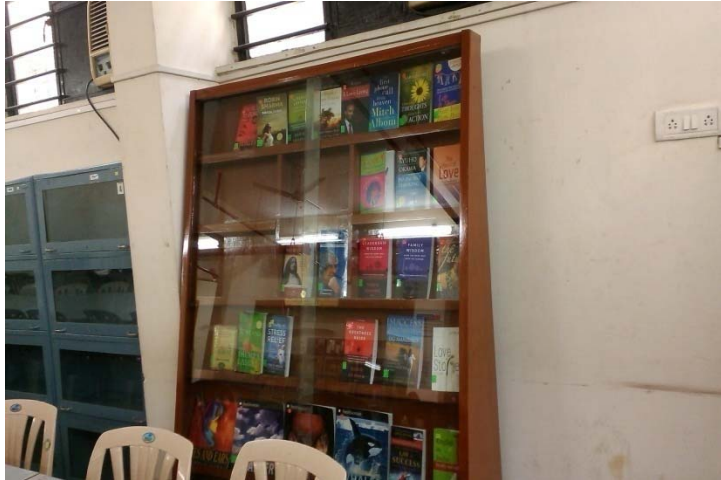
Additional display rack