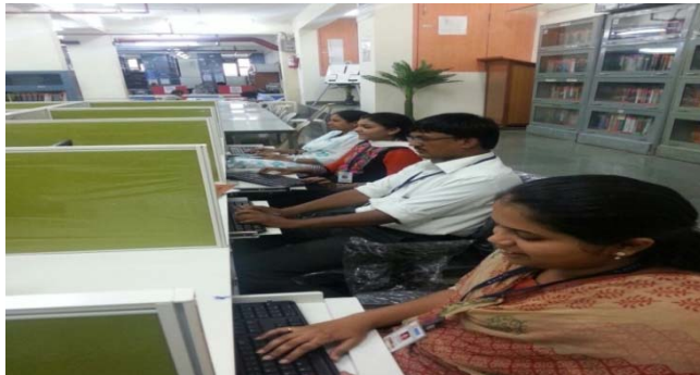
The library study centre

1 Library Study Centre for research work & internet browsing