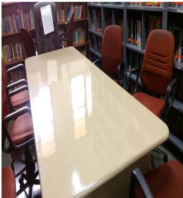
Faculty table varnished & repainted