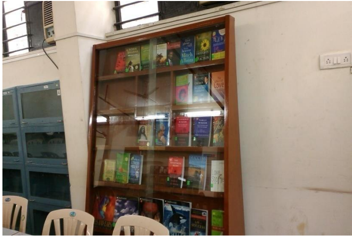
Additional display rack