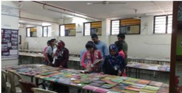
Students at the Sale of Specimen copies - Library Reading Room

A number of books were purchased by the students and the revenue generated from the sale was nearly Rs 3000. The feedback from the students indicated that they found the initiative very useful. The highlight of the event was that it enabled needy and financially inadequate students to buy books at very low prices.