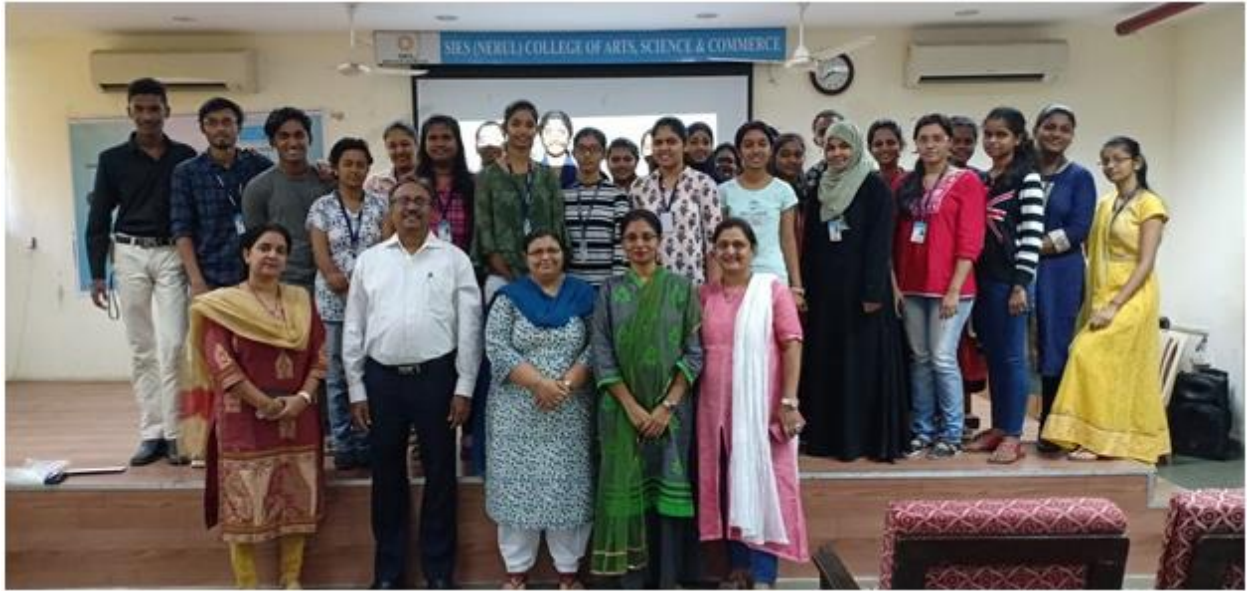
Leadership Skills – group photo