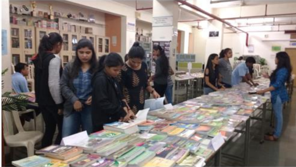
Sale of Specimen copies - Library Reading Room