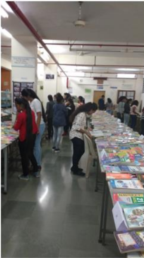
Sale of Specimen copies - Library Reading Room