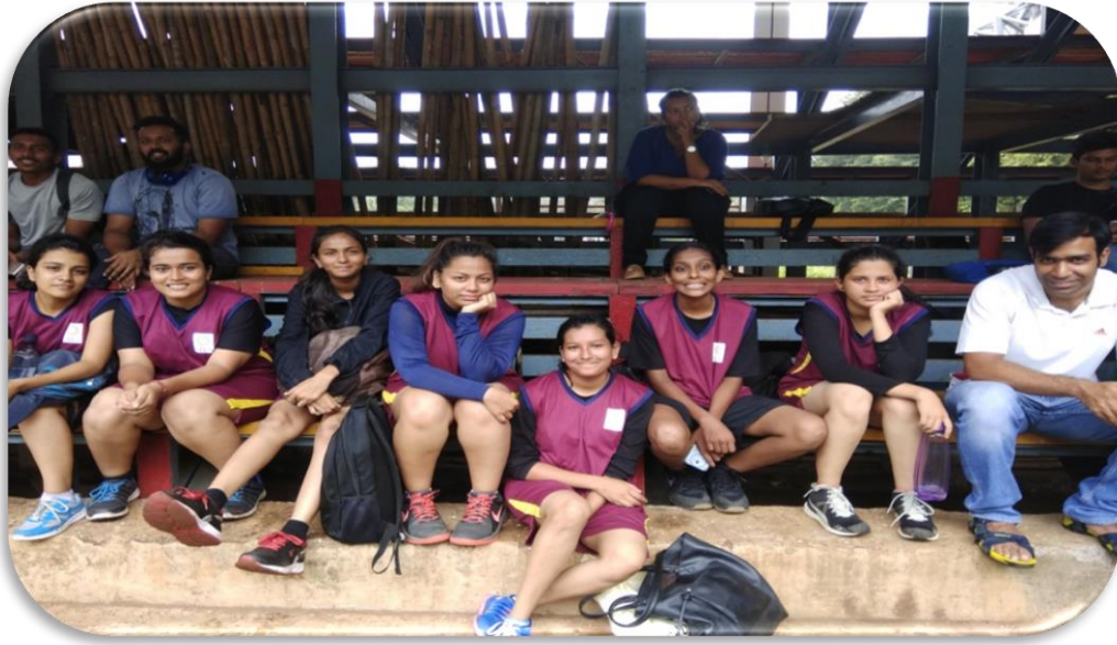
Degree College Basketball Team.