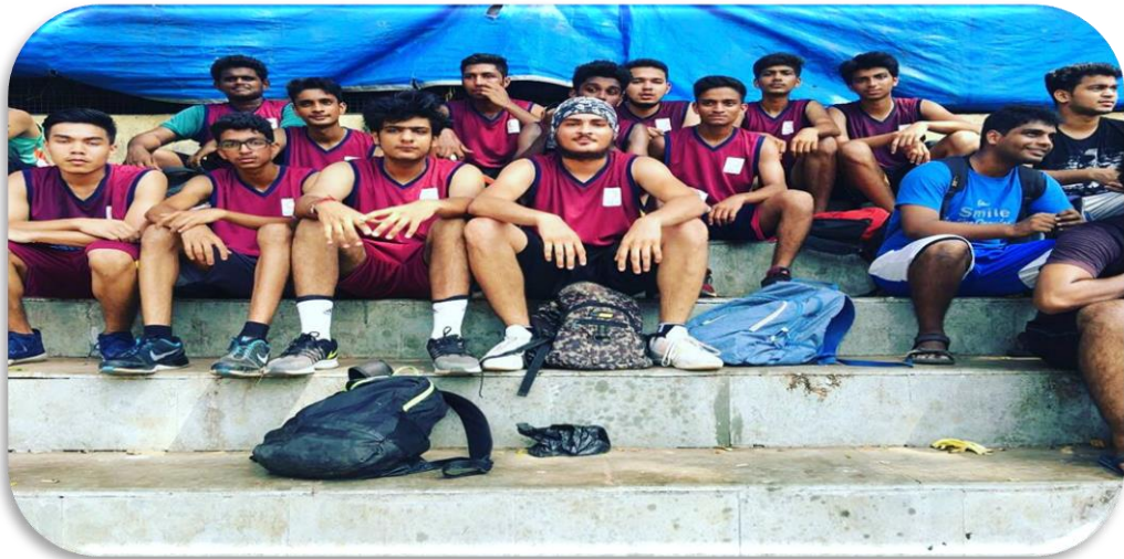
Degree College Basketball Team.