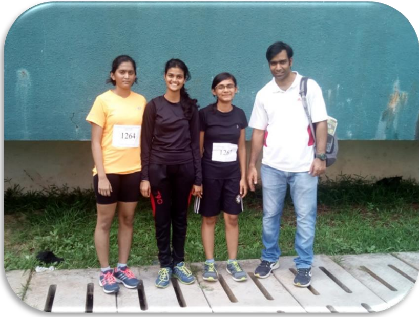
Second from left.