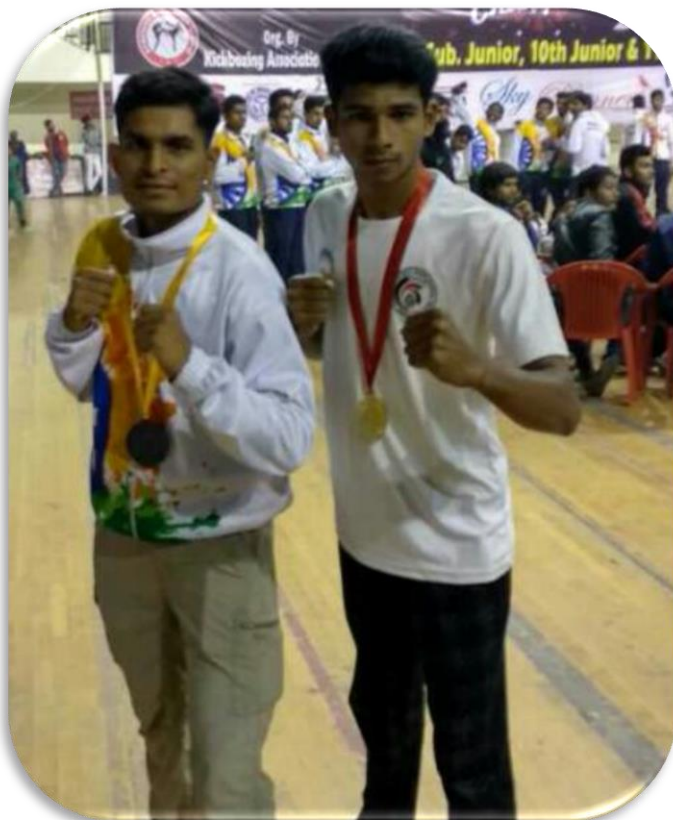
Secured 1 st place in 5000m race