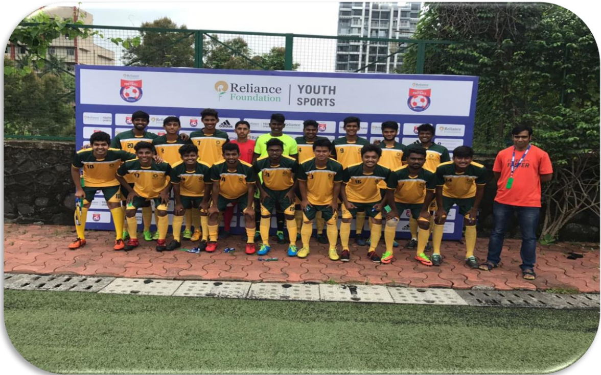
Degree College Football Team.