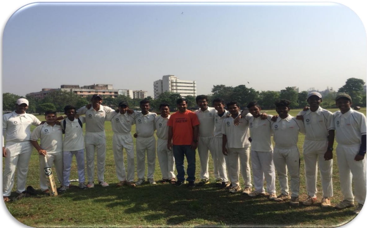
Cricket team won two matches of inter- Collegiate organised by University of Mumbai.