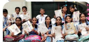
A CSR INITIATIVE ★