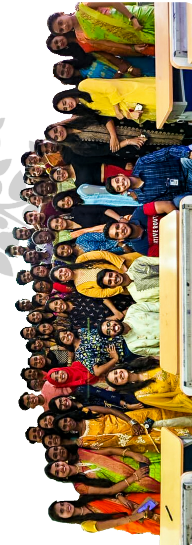
Team ISR 2019 - 2020

ISR was initiated as a separate committee of SIES in July 2018, with the aim to connect with empathy, not sympathy that will help the ones who do not have proper support for pursuing their goals, to grow, and evolve into independent individuals. For this purpose, SIESASCN ISR committee is associated with the Kotak Education Foundation that provided them with multiple avenues to reach and help the community and achieve the core motive of the committee. As this was the second year for the committee, we were able to expand our horizons and conduct activities both within and outside the college.