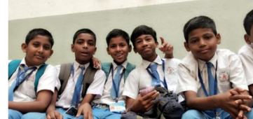
BEYOND THE SKY 🌟